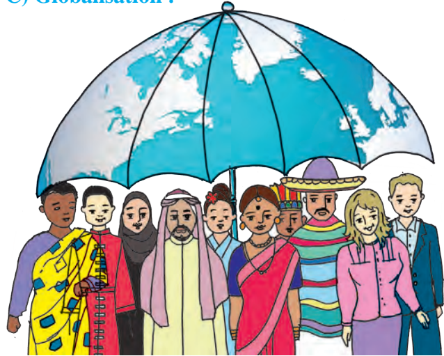
Fig. 9.3 : Globalisation